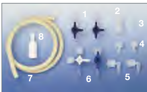
Figure 1: Cut Pharmed (yellow) tubing from Minimate TFF system to match the length of the tubing below: